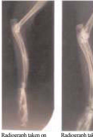
Fig.1: Radiograph taken on 15,30 and 45 days in control group

Radiograph taken on 45 days on lateromedial position in control group