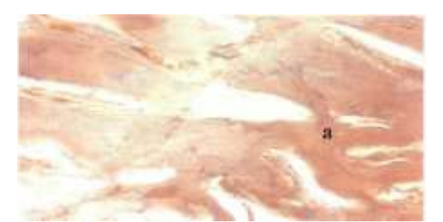
Fig. 6: a: Osteoblasts with basophilic cytoplasm in bony trabeculae formation in experimental group (X200; H&E)

experimental rabbits. Appearance of structural pattern treated in group (I) almost similar to normal bone<sup>[26]</sup>. Haversian septum formed well with variable thickness of trabeculae in treated rabbits was observed<sup>[27,28]</sup>. Their findings showed that TES can affect on the site of fracture by stimulation of certain growth factors. Research supports the idea of a local tissue response following increasing DNA, ATP and protein (collagen) synthesis. This experimental and also researchers confirmed that the effects of TES could be multifactorial. Clinical observations, radiographic findings and histomorphological examination of callus sample supported that progress of healing, so this results showed in group II rabbits.