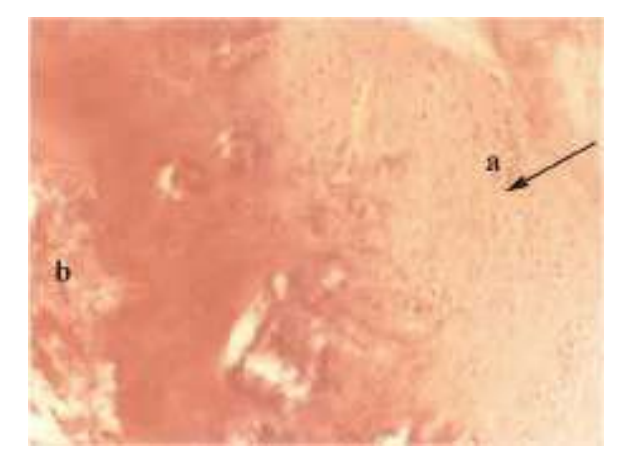
Fig. 3: Newly formed fibrocartilage in control group (X100 H&E). a: chondroblast b: fibrous tissue

Fig. 2: Radiograph taken on 15,30 and 45 days in experimental group