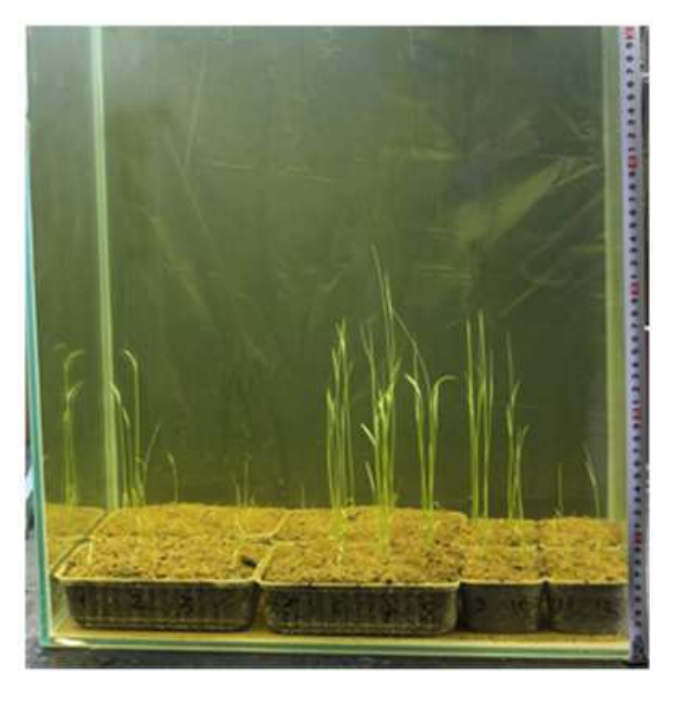
Fig. 1. The evaluation of submergence tolerance

In a laboratory experiment, rice seeds were soaked in water for 12 h and then were sown in the soil (Azarin et al. , 2016). Deep flooding was simulated in an aquarium with a 50 cm layer of water (Fig. 1). Control plants were grown in physiological normal conditions. After 21 days the survival rate was measured.