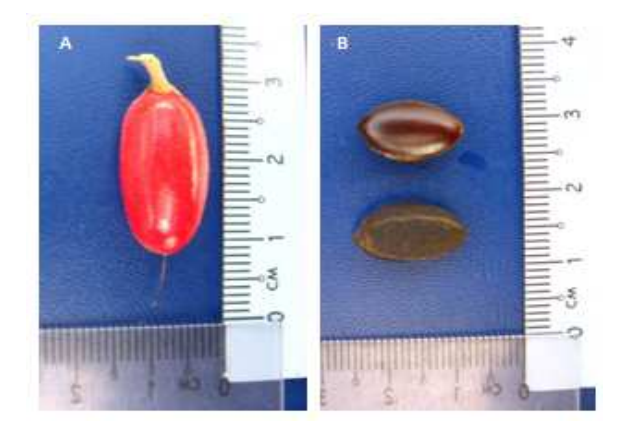
Fig. 1. Synsepalum dulcificum (Sapotaceae): (A) red ellipsoid ripen berry, (B) dark brown to black colour seeds with hard seed coat