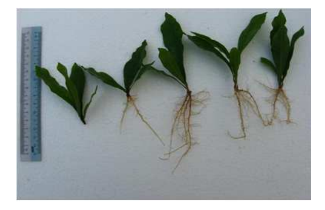
Fig. 3. Softwood miracle fruit cuttings of Synsepalum dulcificum showing sparse primary roots (from left to right: 0, 200, 400, 600 and 800 mgL<sup>-1</sup> IBA)

Cross sections of stem cutting at day 0 showed the normal juvenile stem organization ( Fig. 4A ). The cortex is multi-layered and makes up one-fifth of the stem diameter, phloem was surrounded by 2-3 layers of fibers ( Fig. 4B ) which also reported by Ayensu (1972), xylem consists of continuous cylinder with narrow uniseriate rays and pith composed of thick-walled cells with laticiferuous ducts. Callus was first detected in the cortex 3 weeks after cuttings were planted. Cell proliferation occurs in the cortex region near to the fibers layer and phloem ( Fig. 4C ). Root primordia developed from the secondary phloem with a dome-shape apex and penetrated the cortex 5 weeks after the cuttings were sowed ( Fig. 4D ).