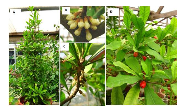
Fig. 2. Synsepalum dulcificum : (A) Pyramidal tree form, (B) flowers produced in cluster at the axillary bud, (C) downward-facing flowers are solitary, nearly sessile and fragrant, (D) a five years old plant with red berries

Miracle fruit has been cultivated not only for its fruit but also as an ornamental plant. The tree form of Synsepalum dulcificum is cone or pyramid shape (Fig. 2A). The moderate growth rate and free branching characteristic of this plant make it a potential ornamental small tree or shrub, hedges and potted plant for urban planting. Pruning is not necessary since it is bushy becoming a beautiful tree form naturally. Besides that, the miracle fruit plant also can be trained into a bonsai or topiary. Synsepalum dulcificum has red to orange colour young leaves which adds to the aesthetic value of the plant. The plant produces fragrance flowers (Fig. 2B and 2C) and edible fruits (Fig. 2D) all year round; thus it is a good candidate for a fragrant garden or edible garden. The miracle berries turn bright red when ripen and makes the tree a stunning and attractive ornamental plant. The plant also attracts birds to feed on its berries.