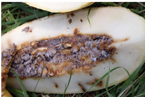
Fig. 2. Melon fruit damaged by melon fly