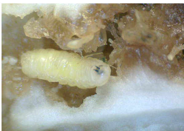
Fig. 3. Larvae of a melon fly inside a damaged fruit