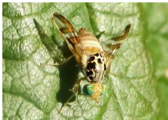
Fig. 1. Melon fly ( Myiopardalis pardalina Big.)

According to the data of the Ministry of Agriculture of the Republic of Kazakhstan, the area of foci of the flies on the territory of the Republic of Kazakhstan is estimated at 13,000 hectares, i.e., about 15% of its potential range of phytosanitary risk (Yskak et al. , 2016).