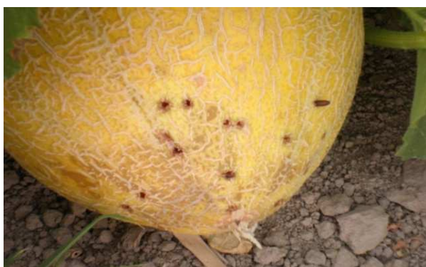
Fig. 4. The transformation of larvae into puparia sometimes occurs when larvae leave the damaged melon fruit