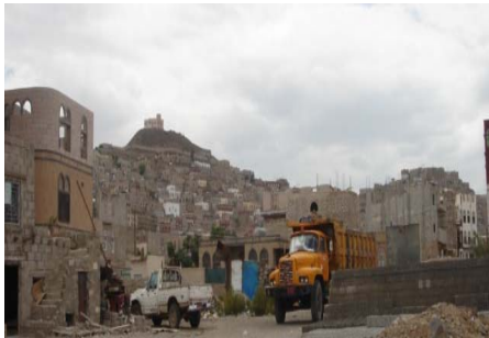
Fig. 3: Types of material used in Sana'a houses