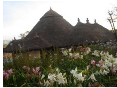
c. Straw housing in rural areas around Sana'a