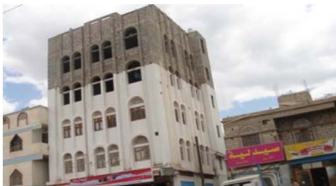
Fig. 4: Commercial types of arches used in Sana'a