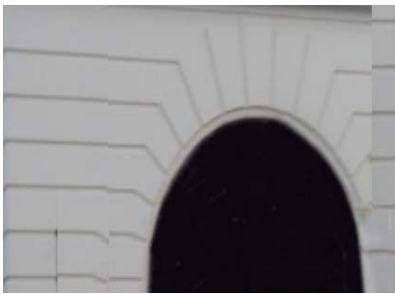
b. Modern arch shape