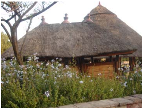
a. Wood housing in rural areas around Sana'a