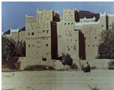
b. Mud houses in ancient Sana'a