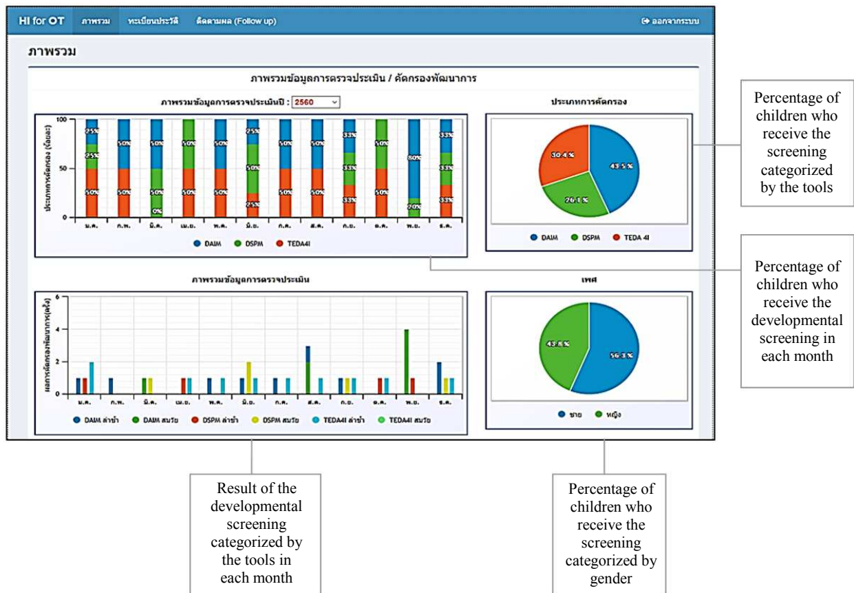
Fig. 3: The data display and summary part

The assessment part showed the assessment tools that care managers were able to choose. These tools related to the developmental areas in which the children were delayed. The lists of assessment tools in terms of GM