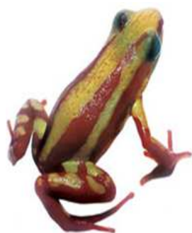
Fig 1. Epipedobates tricolor