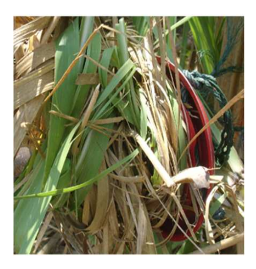
Fig. 3: The sugarcane leaves get stuck with rotate dish

The quantities of cane tops, leaves and leaf sheaths affect harvesting management process. Table 3 shows comparison of sugarcane harvest time per bundle during leaves removing and leaves not removed. The sugarcane harvest of leaves removing took 1.72 min/bundle whereas leave not removed took 2.52 min/bundle. Therefore, if conversion time of sugarcane harvest is per rai, the sugarcane not removed leaves took time of 37.0 h/rai, and more than removed leaves of 11.4 hours. Moreover, leaves and leaf sheaths are carry soil, sand and mud into sugar production process.