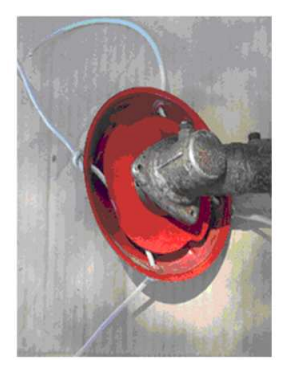
Fig. 2: A soft wire on rotate dish

Moreover, the cane top of stem and leaf removing were weighed too. The density of sugarcane and its leaves affects the time of harvest. Therefore, we compared the time of sugarcane harvesting by workers during leaves removing and leaves not removed too.