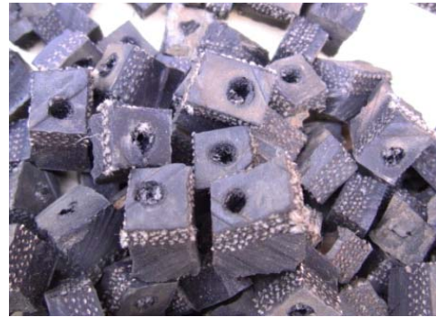
Fig. 1: Waste tyre rubber chips with 6mm diameter hole

The proposed concrete will have higher strength, high resistant to acid attacks and high resistance against freezing & thawing. This is called as New Generation Concrete (NGC). No earlier research had explored the