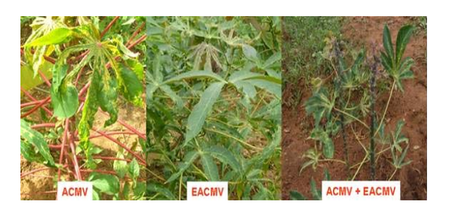
Fig. 1: Various symptoms caused by cassava mosaic Begomovirus disease in the different cassava production areas in Togo: Leaf curling symptom with yellowing caused by ACMV on a local cultivar Yovovi; Leaf curling symptom caused by EACMV on a selected cultivar "KH<sub>1</sub>04" and leaf curling symptom small leaves caused by ACMV in mixed infection with EACMV on a selected cultivar KH<sub>1</sub>04

Phylogenetic analysis: CP gene sequences were considered for this analysis due to their importance for Begomoviruses replication gene expression<sup>[14]</sup>. The phylogenetic tree was estimated using the neighbor-joining method<sup>[13]</sup> with the Unweighted Pair-Group Method with Arithmetic average (UPGMA) distance matrix (MegAlign program).