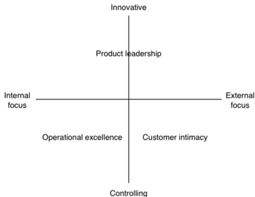
Fig. 1. The relationship between value-disciplines and organizational culture