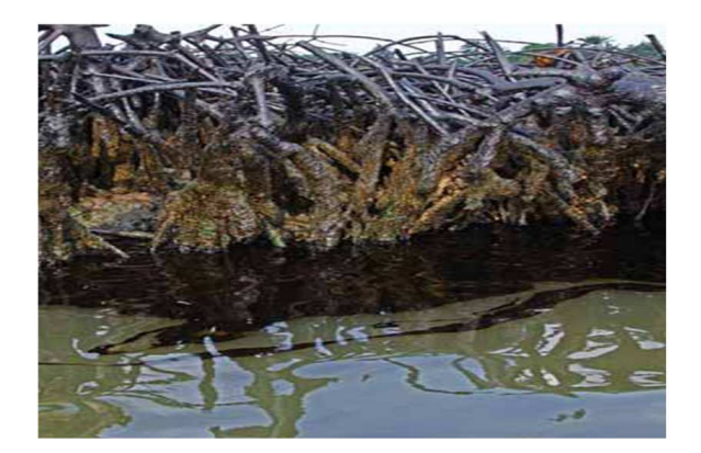
Fig. 1: Mangrove roots heavily coated with a thick layer of bituminous substance in Bonny, South-South, Nigeria

Different levels of heavy metal concentrations have been reported in Nigerian water bodies by several workers. Obire et al. (2003) on Elechi creek, Omoigberale and Ogbeibu (2005) on Osse River, Southern Nigeria. Ogbeibu and Victor (1989) amongst other Nigerian or indigenous scholars have advocated the use of fish and invertebrates as bio-indicators of water quality. A considerable amount of studies has been carried out on the effects of pollution in Nigerian water bodies. Victor and Tetteh (1988) reported a reduction in fish diversity associated with discharge of municipal wastes and industrial pollutants into the Ikpoba River, while Fufeyin (1998) studied heavy metal concentration in some dominant fish in the river and reported that the fish species showed higher mean levels, with variable contamination factor and bioaccumulation quotient among stations. However, the UNDP Report (2011) documented that the concentrations of PAHs in biota were low in all samples in Ogoniland. In fresh fish and seafood, concentrations were below the detection limit for most of the different PAHs. In a few cases, measurable but low levels were found. This investigation showed that the accumulation of hydrocarbons in fish tissue is not a serious health risk in Ogoniland.