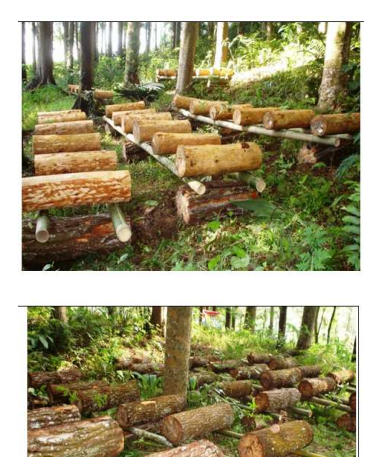
Fig. 1: Experiment installment. Above: the barked logs, Below: the bark-on logs

The experiments were daily inspected for two months to record number of beetle tunnels on each test log. Beetle attack density was determined according to the number of tunnels per-square meter of log surface. The entire data were transformed into \sqrt{(Y + \frac{1}{2})} for ANOVA analysis and then Dunnett's analyses were also conducted for cumulative data at every tree-four day inspection to determine difference of beetle infestation intensity between the treated and untreated logs. A regression analysis was also conducted to evaluate effect of debarking on vulnerability of the logs to the beetle attack from time to time at those observation intervals.