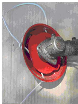
Fig. 2: A soft wire on rotate dish

Moreover, the cane top of stem and leaf removing were weighed too. The density of sugarcane and its leaves affects the time of harvest. Therefore, we compared the time of sugarcane harvesting by workers during leaves removing and leaves not removed too.