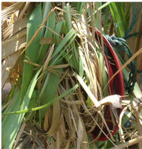
Fig. 3: The sugarcane leaves get stuck with rotate dish

The quantities of cane tops, leaves and leaf sheaths affect harvesting management process. Table 3 shows comparison of sugarcane harvest time per bundle during leaves removing and leaves not removed. The sugarcane harvest of leaves removing took 1.72 min/bundle whereas leave not removed took 2.52 min/bundle. Therefore, if conversion time of sugarcane harvest is per rai, the sugarcane not removed leaves took time of 37.0 h/rai, and more than removed leaves of 11.4 hours. Moreover, leaves and leaf sheaths are carry soil, sand and mud into sugar production process.